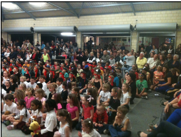
An impressive gathering of Winterfold parents at our recent Edu-Dance concert.

Quote of the Day: "The older I got, the smarter my teachers became."