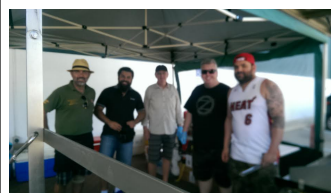
Our wonderful volunteers!

Total funds raised for 2015 Bunnings Sausage Sizzle was $1021.00. Well done to the P&C Sub-Committee and volunteers, you made this day a great success.